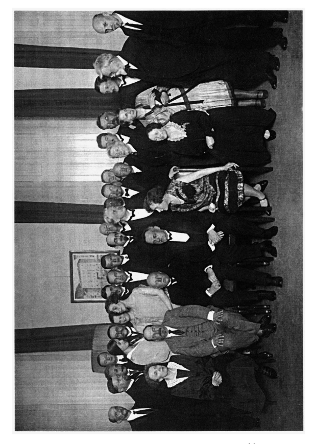
Russian Natural Scientists Week in Berlin 1927<sup>16</sup>