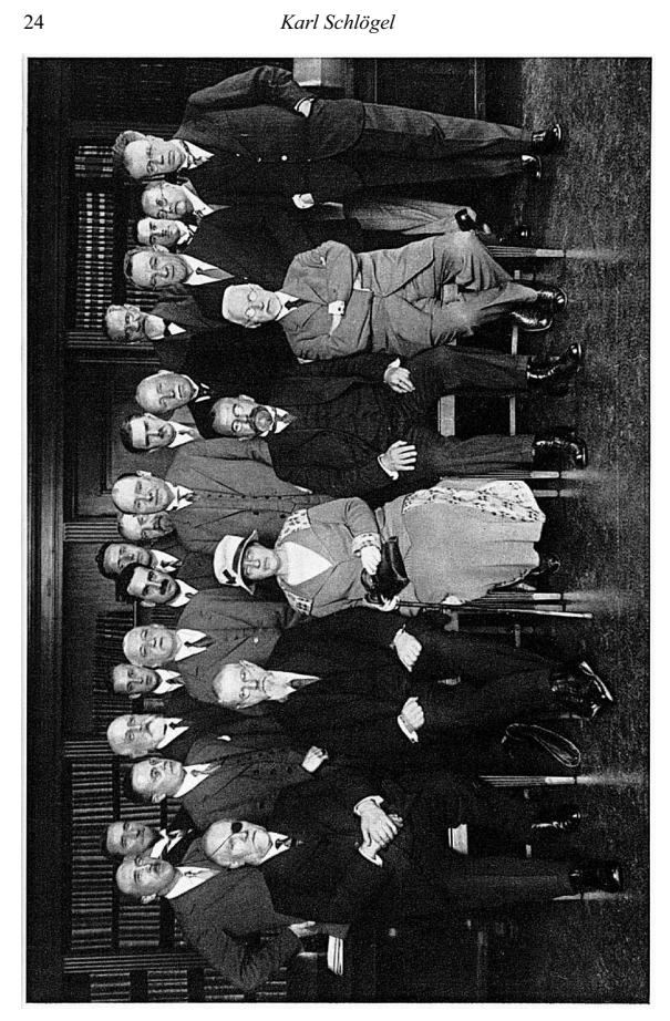
Russian Historians' Week in Berlin, 7–14 July 1928<sup>20</sup>