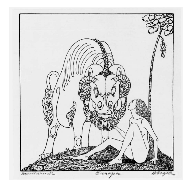
Heinrich Vogeler, Europa, around 1912