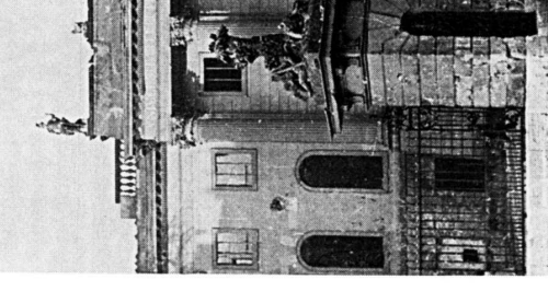
Humboldt University, 1945